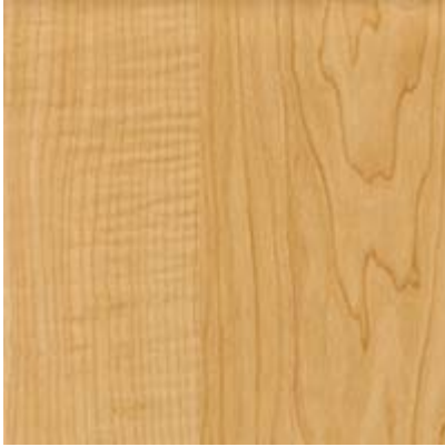
New Hampshire Maple