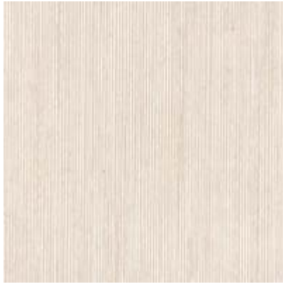
Satin Silk Cream